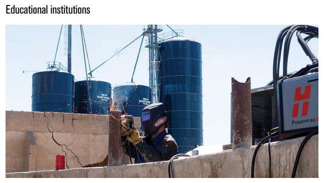
Agricultural and farm equipment maintenance